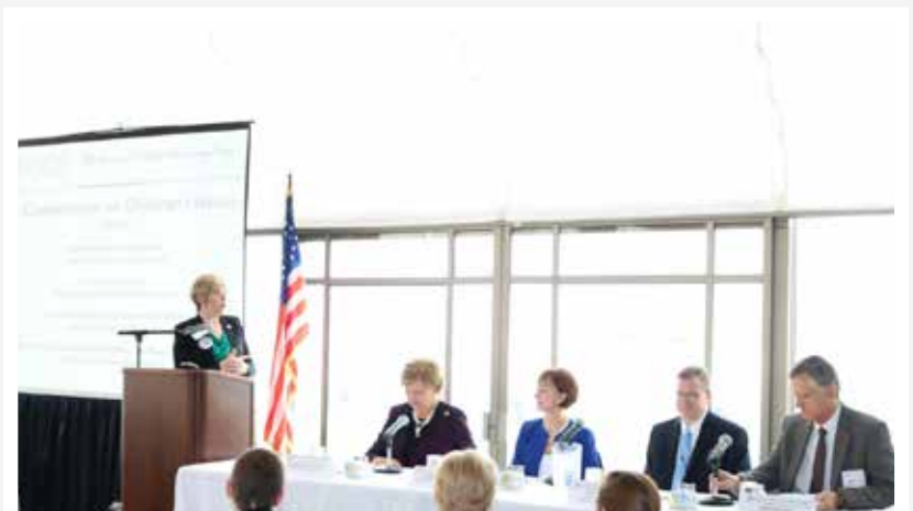
State agency heads share concerns on children's issues.