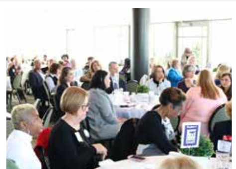
Child advocates have a chance to network over breakfast.

Thank you advocates! Your hard work and advocacy efforts paid off during the 2018 legislative session. VOICES advocates from across the state united together to inspire positive change in their local communities by engaging in state-based advocacy.