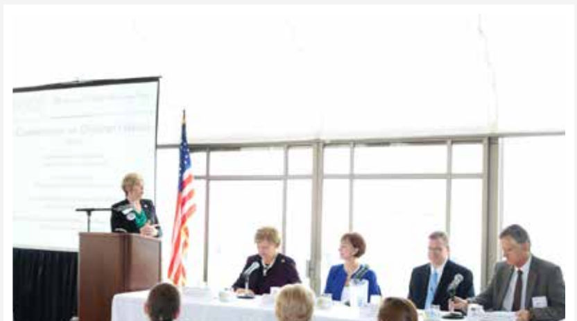
State agency heads share concerns on children's issues.