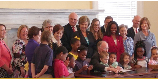
Alabama Children's Cabinet- Governor Bentley announced the creation of the Alabama Children's Cabinet created by Executive Order 17 on April 12, 2016. The Cabinet will serve as an advisory body in formulating policies, encouraging innovation, and discussing issues critical to the needs of Alabama's children.